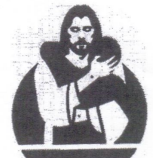
NEW JERUSALEM MISSIONS

Fresh fruit & vegetables Dairy: milk, eggs & butter Cheese (sliced and shredded) Peanut butter and Jelly Sandwich breads Lunch meat Chips Cereal Beef, pork, boneless chicken Baking items (chips, nuts, etc.) Canned tuna/chicken Canned vegetables Canned fruit